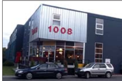
Venu1008 in Inglewood where you can join us on the second Tuesday of every month.

As you know, we moved our meetings to a warm and welcoming meeting space in Inglewood. Free and ample parking was the most noticeable benefit, but also was the great social atmosphere. Instantly the feedback told us that this move was the right decision. Also noticed was that members stayed to chat with fellow members long after the meeting had ended. This alone showed our members' approval.