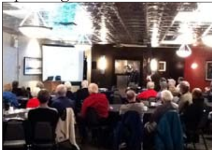
Inside Venu1008 where meetings are held